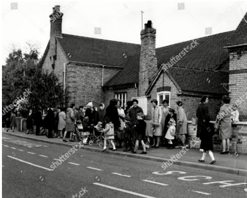
Buckden School in the Victorian era.

This looks very different from Education today.