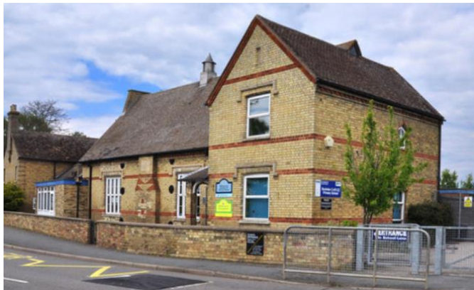
Buckden School today.