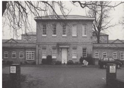
Photograph of the workhouse building in Eaton Socon